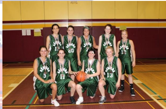
Kodiaks Seniors – Amos, Quebec Bronze Medalists