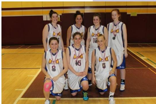
Val D'Or – Val D'Or, Quebec Silver Medalists