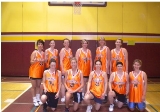
Nikki's - Timmins, Ontario 2011 Tournament Champions