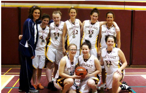
Theriatult 1 – Timmins, Ontario Silver Medalists