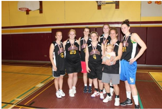
Monstars, Sudbury, Ontario 2012 Tournament Champions