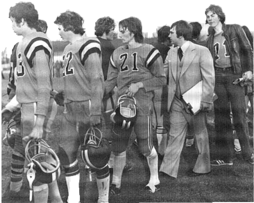
2. The Thunderbolts exchange formalities after the game.