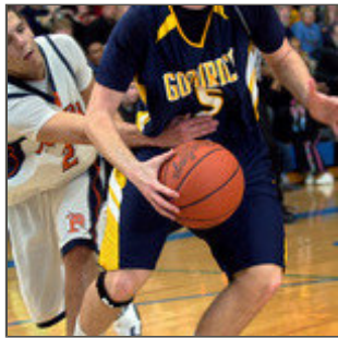
Goodrich Vs. Powers Catholic Basketball