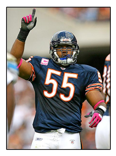
LANCE BRIGGS CHICAGO BEARS