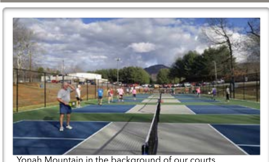
Yonah Mountain in the background of our courts . . .

Spring Pickleball Tourney - May 5th - 7th