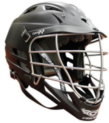
$165.00 CASCADE Cascade CPX-R Helmet With Chrome Wire Mask