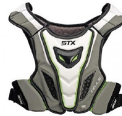
$92.00 STX STX Cell III Shoulder Pad Liner-WH-MD