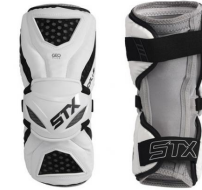
$85.00 STX STX Cell III Arm Guard