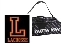
$85.00 BRINE Warrior Blackhole Lacrosse Equipment Bag (Black)

+ NAME/TEAM NUMBER PERSONALIZATION AVAILABLE