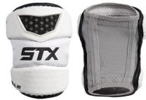
$52.00 STX STX Cell III Elbow Pads