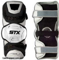
$65.00 STX STX Cell III Arm Pads