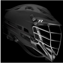
$195.00 CASCADE Cascade R LAX Helmet - Chromanium