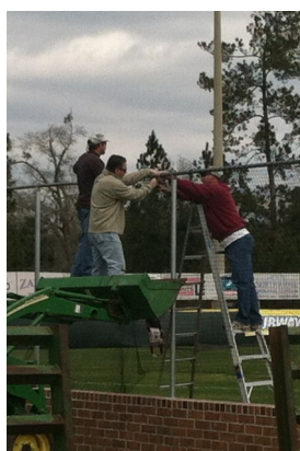
TBB Parents hang nets at a Work Day last spring

Encourage participation of all members by establishing a well-rounded fundraising plan which includes different types of fundraising. Allow members to make “in-kind” contributions of services or products that reduce budgeted expenses. In addition, foster open communications with members on current status.