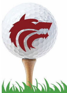
Monday, October 28th 4th Annual Chiles Baseball Golf Tournament

The 4th Annual Chiles Baseball Golf Tournament will take place on Monday, October 28, at beautiful Golden Eagle Country Club. This is our PREMIER fundraising event of the fall, and a successful tournament will put us in great shape leading into the spring season.