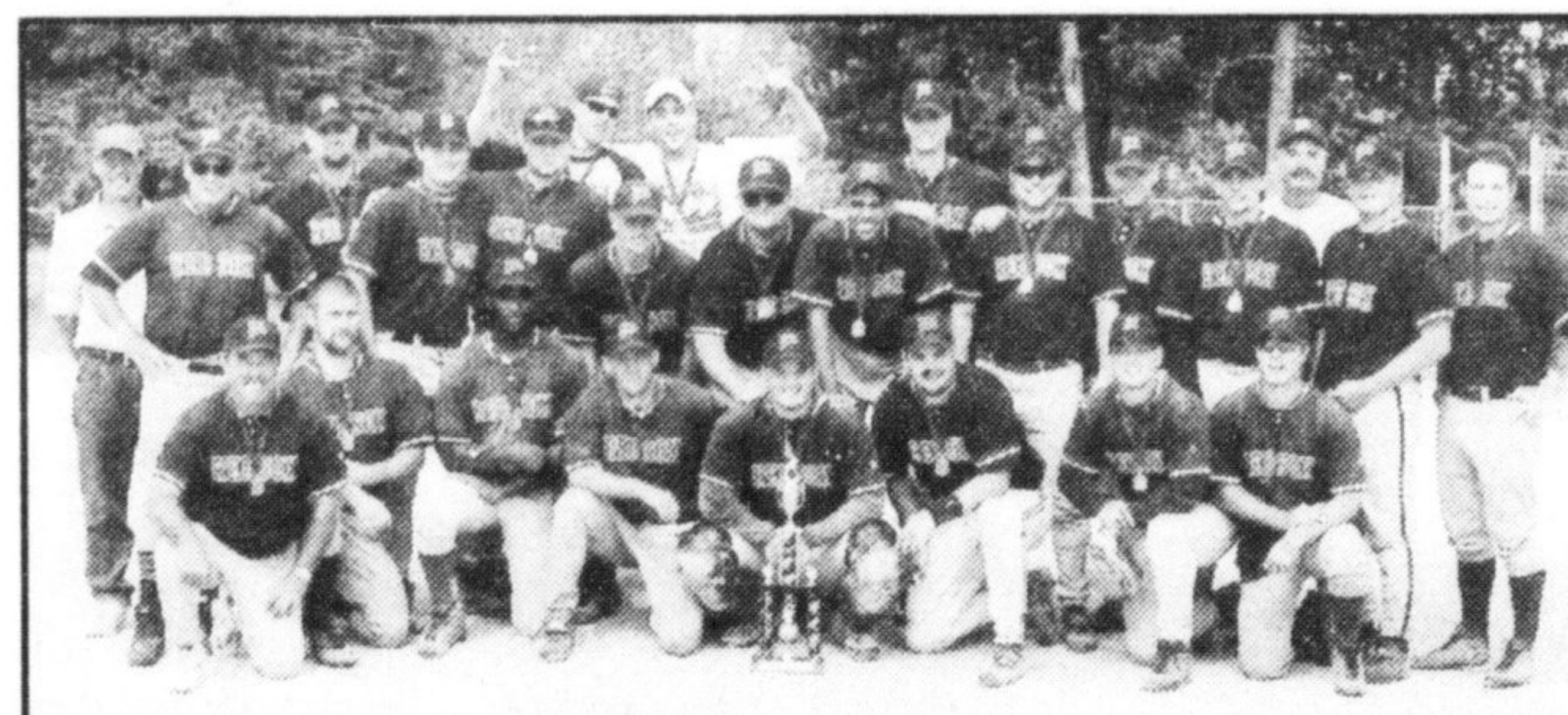
Milton's Senior Red Sox celebrate their Ontario 'C' championship win.

Milton begins today at 6:30 p.m. against Erindale at Ninth Line and will play its remaining games tomorrow at Brian Best. The Red Sox advanced to the final four with a first-round win over St. Catharines.