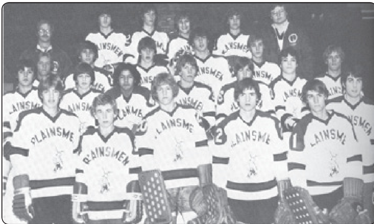
1980-1981 Inaugural Team