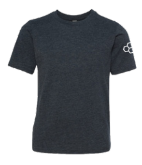
SLIGHT COLOR VARIATION MAY OCCUR IN YOUTH SIZES