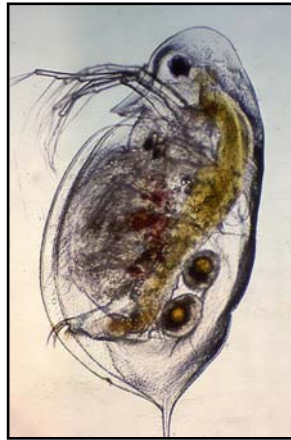
Figure 1. Image of a calcium-rich Daphnia .

Calcium is a nutrient that is required by all living organisms. For example, water fleas ( Daphnia , Figure 1), which are tiny organisms called zooplankton, are very sensitive to declining calcium levels. Daphnia use calcium in the water to form their calcium-rich body coverings when they moult.