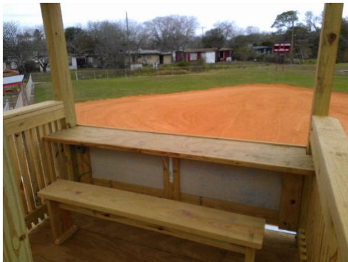
Replaced/repaiored all 4 Scoreboxes